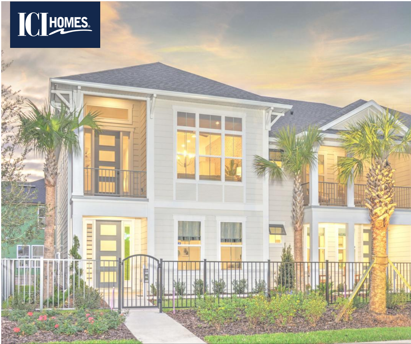
THE BARTRAM - B at NOCATEE