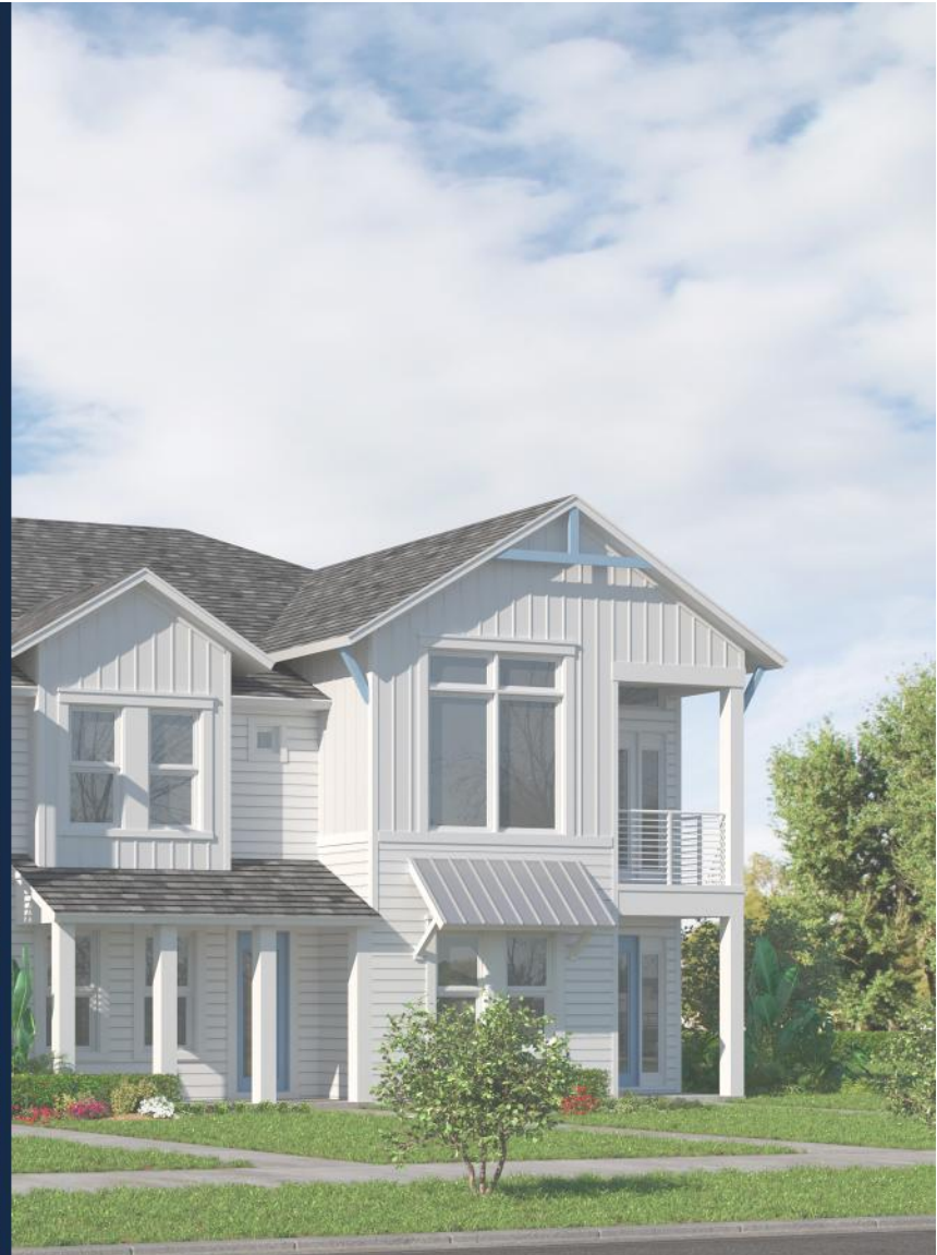
THE CASTILLO - C at NOCATEE