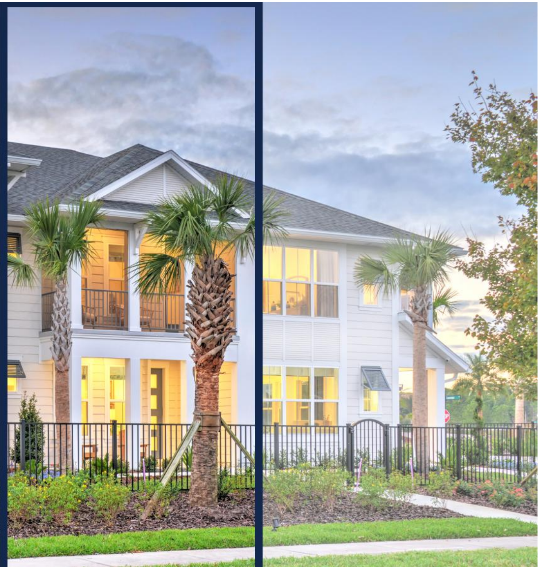
THE CASTILLO - WEST INDIES