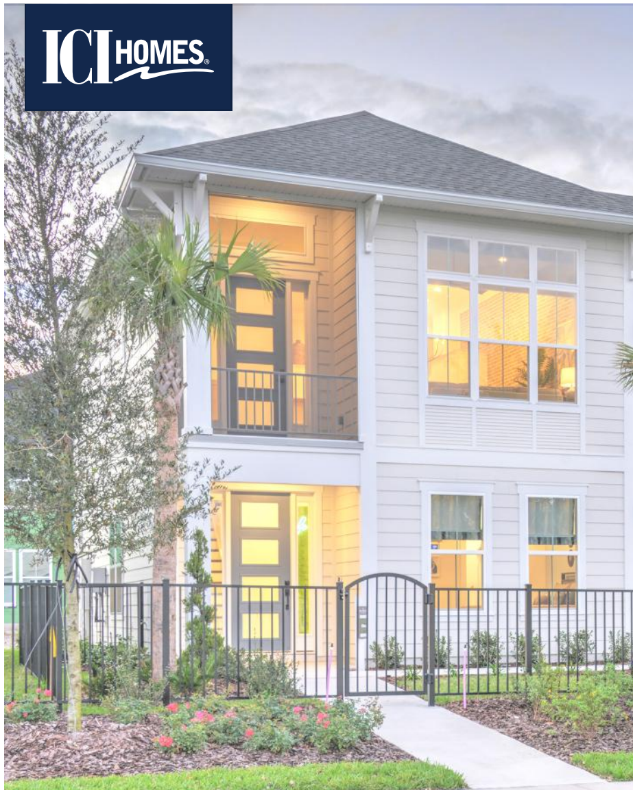
THE CASTILLO - C at NOCATEE