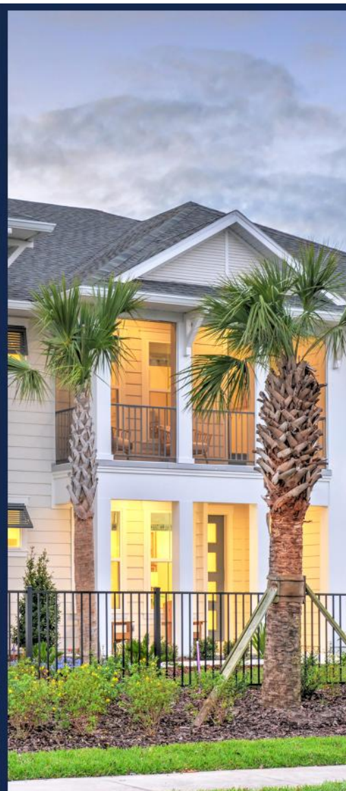
THE CASTILLO - WEST INDIES