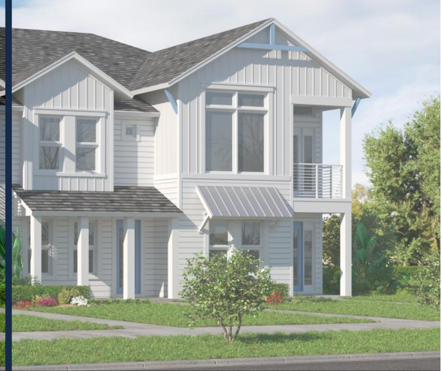
THE CASTILLO - FARMHOUSE