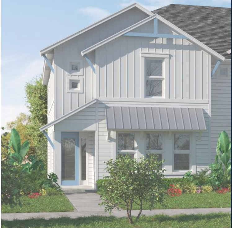
THE CASTILLO - C at NOCATEE