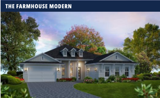
THE FARMHOUSE MODERN

Living Area: 2,624 ft 2 Under Roof: 3,542 ft 2