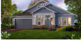
THE FARMHOUSE MODERN - TILE