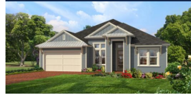
THE COASTAL MODERN