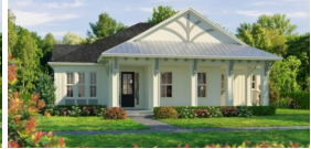
THE WEST INDIES