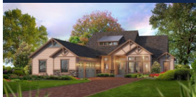
THE CRAFTSMAN II