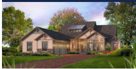
THE CRAFTSMAN II