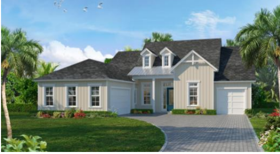
THE COASTAL MODERN - CR