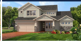
THE CRAFTSMAN MODERN